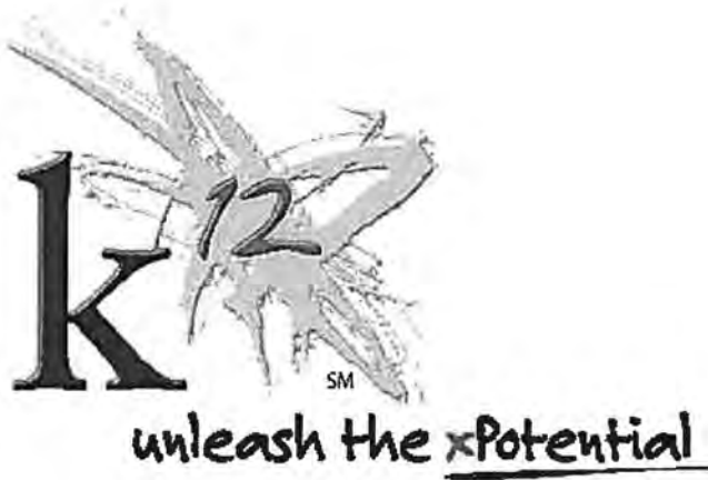
Exhibit B K12 Proprietary Marks